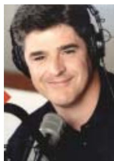
3PM - 6PM Sean Hannity