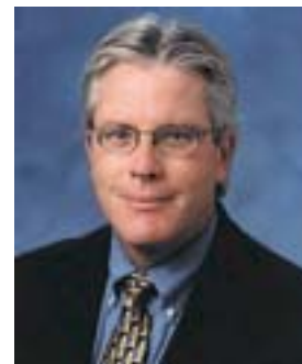
6PM - 9PM Hugh Hewitt