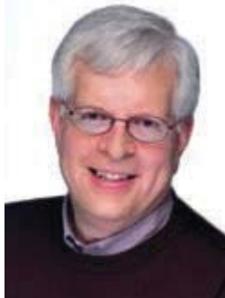
12N - 3PM Dennis Prager