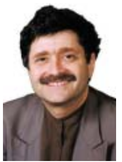
9PM - 12AM Michael Medved