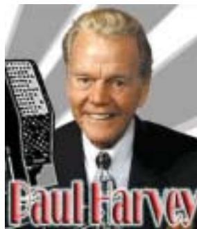
9AM, 11:45AM, 6PM Paul Harvey